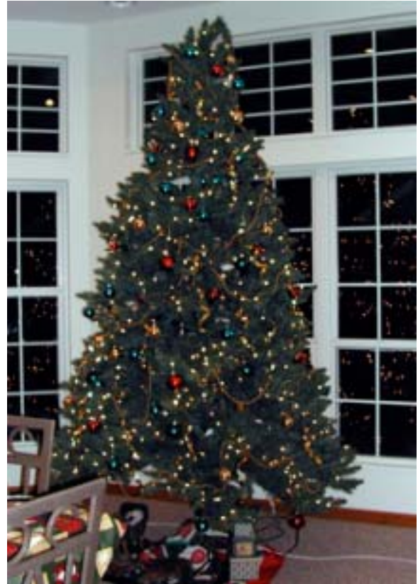
(see Holiday Party , page 2)

As usual, the festivities began with people sharing their holiday wishes and catching up on the news of the club, if they had not attended the last few events. It was good to see some newer members, as well as some of the "old folks" who had been absent for awhile. Although the weather was milder than some years, there was still a lot of talk about vacationing in sunnier climes.