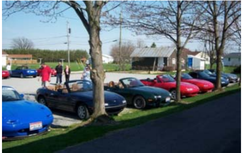
The lineup of beauties at the end of the first 2009 meander.

As usual, there was a lot of car talk and some discussion of what went on over the winter. It was good to see our friends again and start the new season of on-the-road adventures.